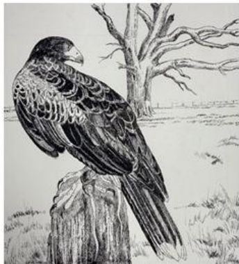
Wood engraving by Cathryn Kuhfeld